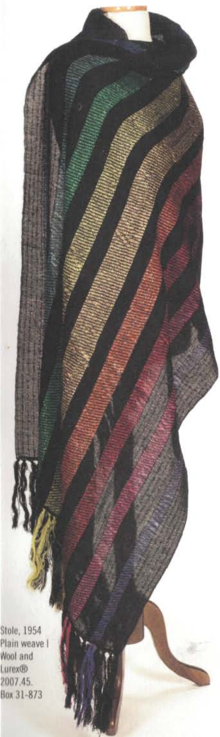
Stole, 1954 Plain weave Wool and Lurex® 2007.45. Box 31-873