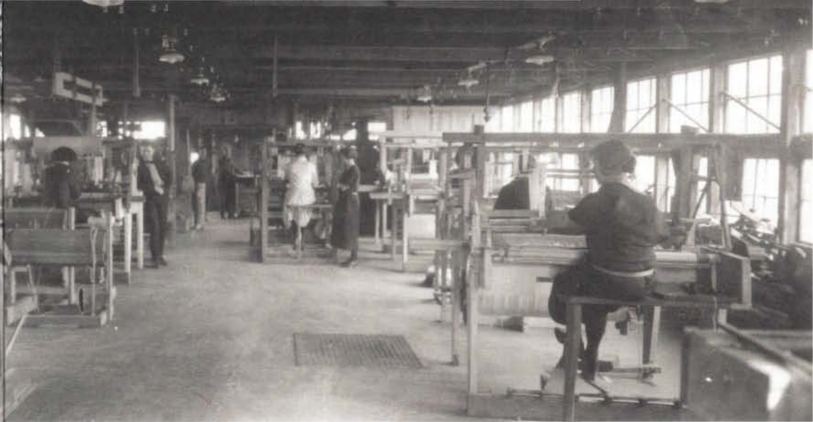
The loom house, ca. 1925