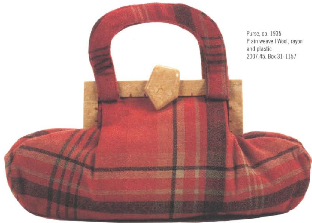
Purse, ca. 1935 Plain weave | Wool, rayon and plastic 2007.45. Box 31-1157