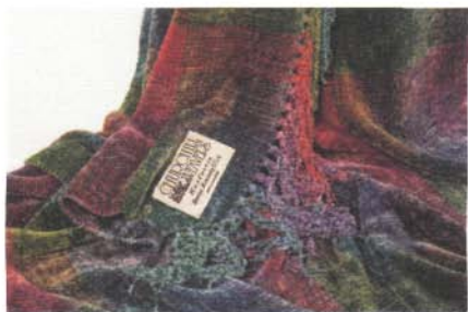
Throw, 2006 Plain weave | Rayon chenille 2007.45.Box 31-1878

Direct research inquiries or schedule an appointment to access the collection on site by calling the Kentucky Historical Society at 502-564-1792. Institutions may request an artifact loan via the same number.