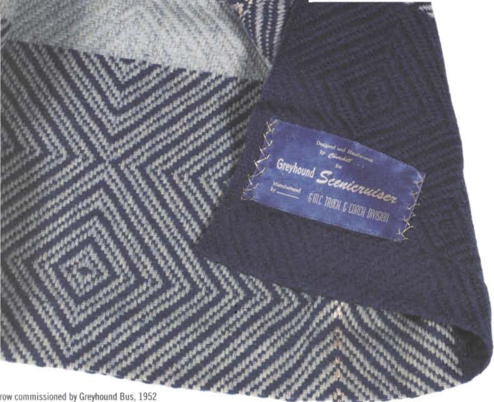
Row commissioned by Greyhound Bus, 1952