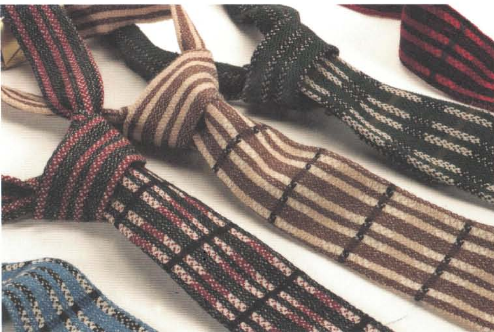
Neckties, 1958 Twill weave | Virgin wool 2007.45. Box 31-2185