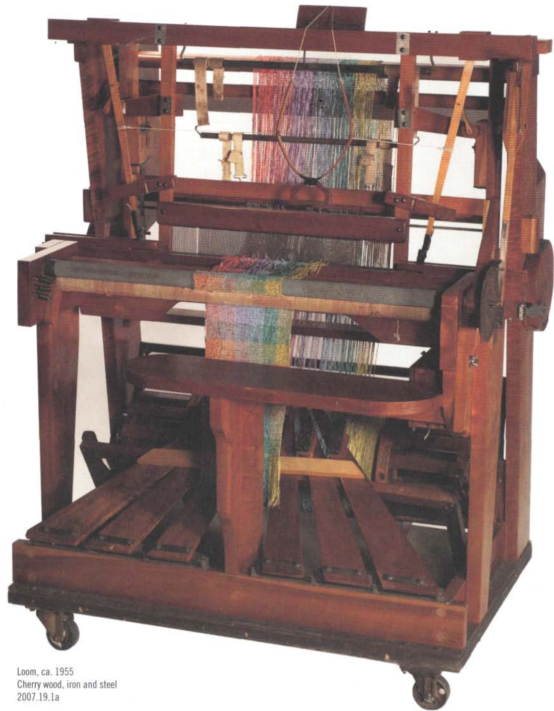
Loom, ca. 1955 Cherry wood, iron and steel 2007.19.1a